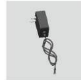
AC Power Adapter