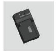
Battery Charger (OPTIONAL)