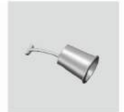
Scleral Depressor (OPTIONAL)