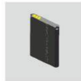
Li-ion Battery (Rechargeable)