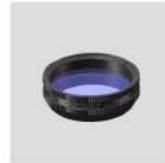
20D Aspheric Lens (OPTIONAL)